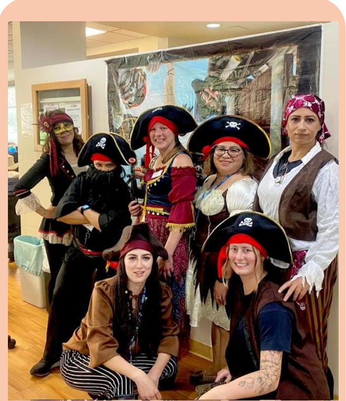
The Pirates were back at it in September AAAAAARGH!